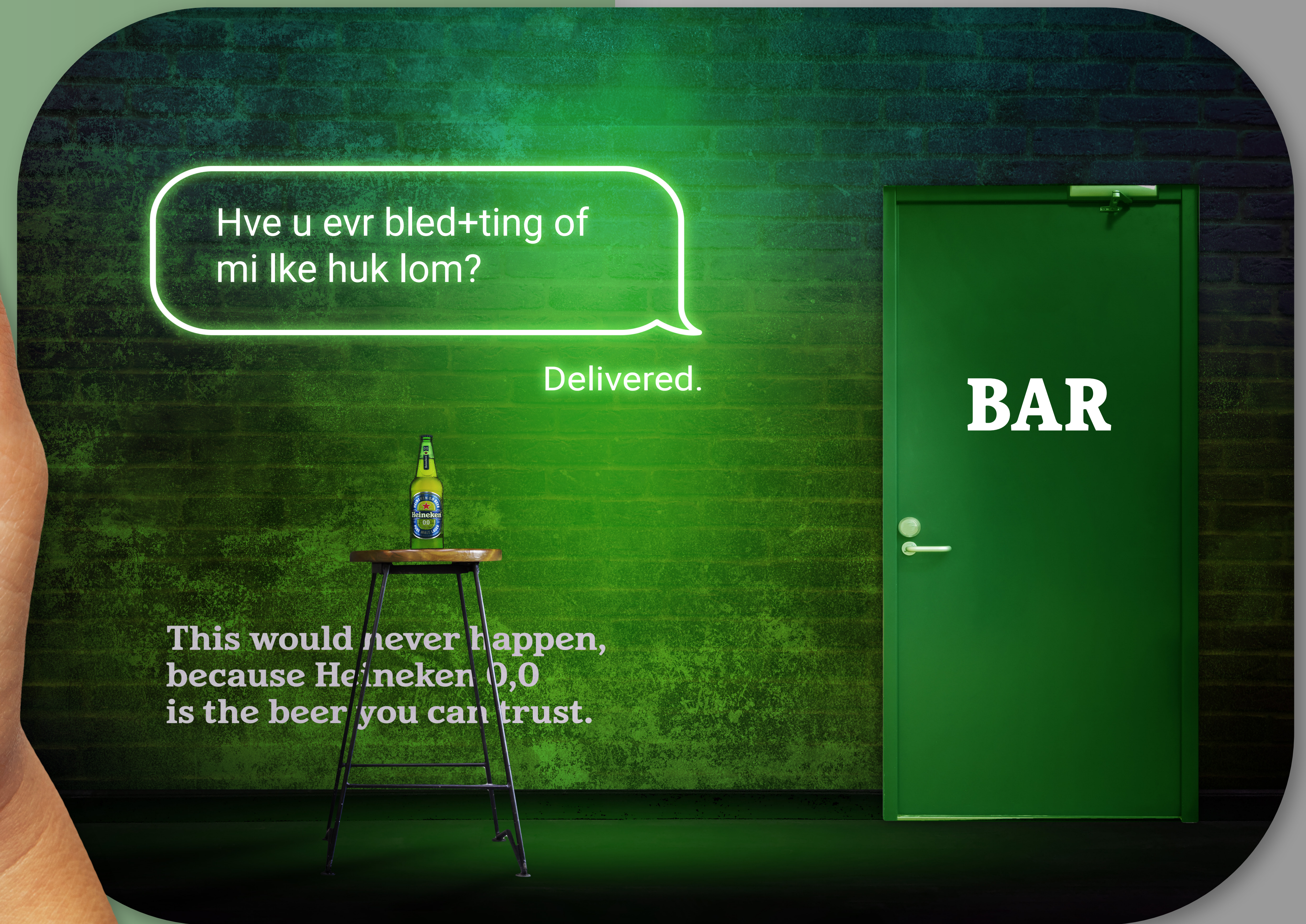
The bar's wall of shame